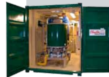
Containerised boiler house

These are exciting times for Clayton Steam Systems since many new applications are being demanded worldwide and the Clayton technology is being used for emerging applications where outdated equipment is no longer suitable for the modern world.