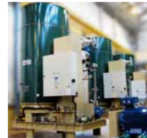
Multiple steam systems