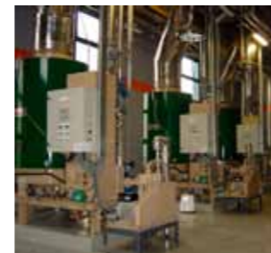
Multiple steam systems