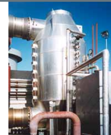
Clayton Exhaust gas boiler