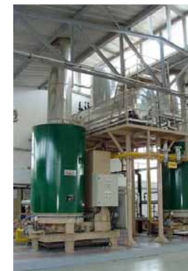
Clayton Steam generators

The Clayton range of Heat Recovery Boilers are a compact and efficient means of producing steam from the waste gases of diesel engines, small gas turbines, incinerators, glass furnaces, enamel ovens, stress relieving ovens and many other applications.