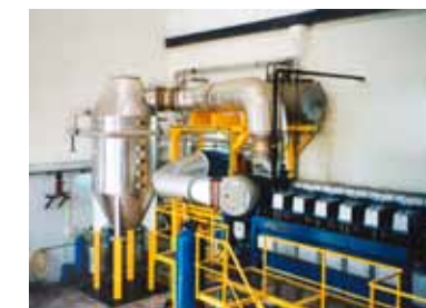
Clayton Exhaust gas boiler