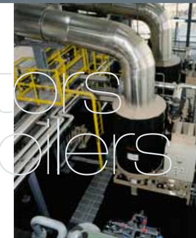
Clayton Steam generators

"Making steam is simple. Making steam with maximum efficiency is Clayton's speciality"