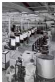
Production line 1940

October 20, 1930, was not the most opportune time in history to establish a new company. It took courage and determination in the face of the Great Depression to lay the groundwork for what was to become Clayton Manufacturing Company. It also took the imagination of far-sighted men to envision a market for a totally new product. That product